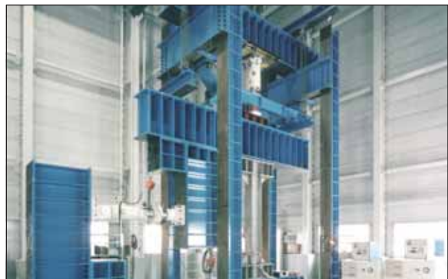
Double-shaft loading machine