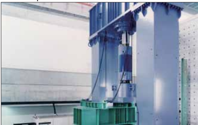
Single-shaft loading machine